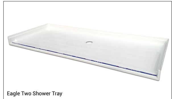
Eagle Two Shower Tray