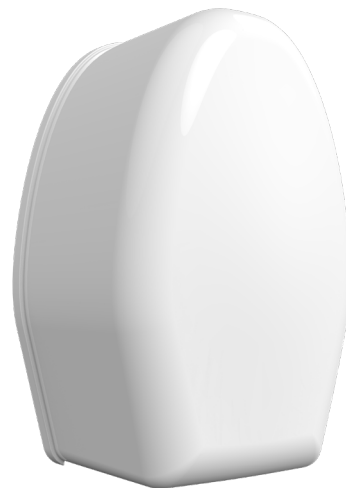
P12 Waste Pump