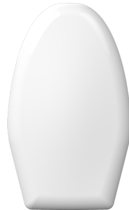
P12 Waste Pump