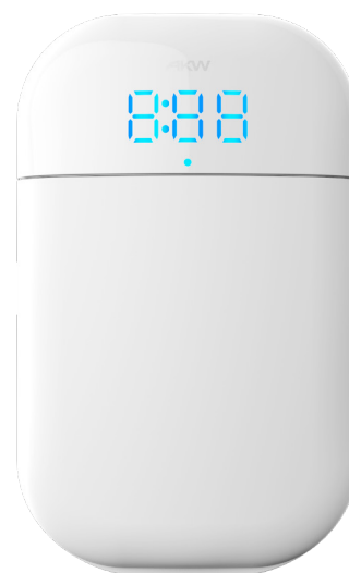
P12 Digital Pump Controller

P12 Digital Pump Controller has 6 electrical entry points